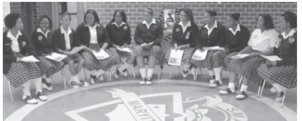
The SMA focus group recently met to discuss Pro-Life issues.

Opinions will help bishops communicate Church's teachings