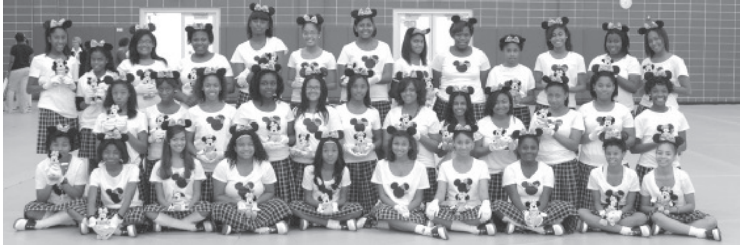
The SMA Class of 2015 (Freshmen/Little Sisters) gather at Freshmen initiation for a photo.

SMA tradition was a day of fun, games and bonding