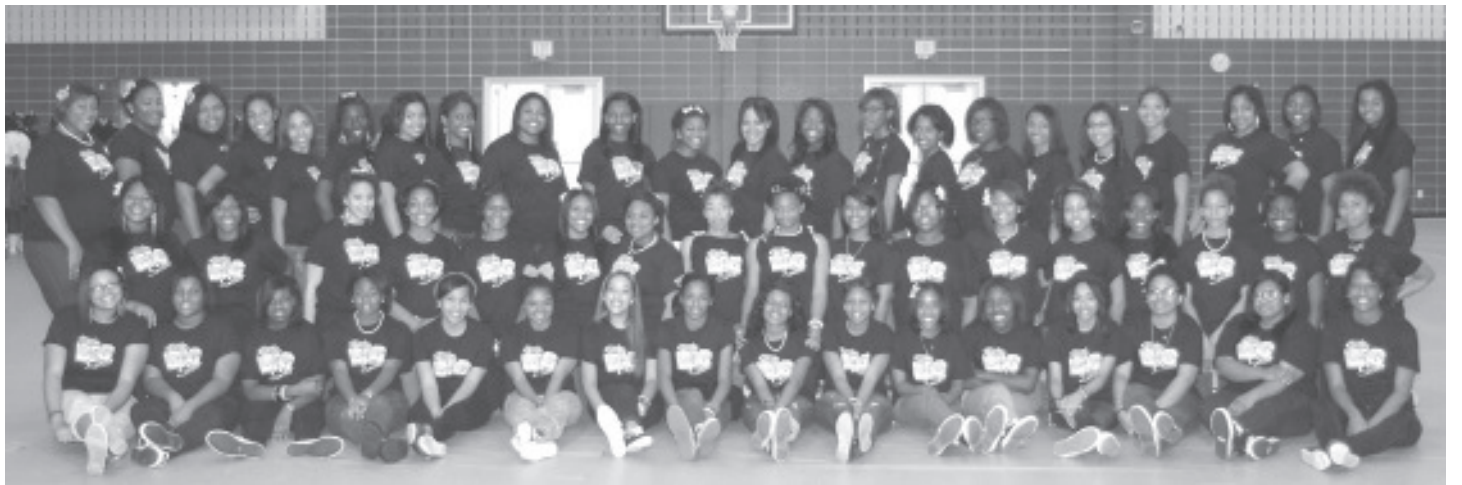
The SMA Class of 2012 (Senior/Big Sisters) helped introduce their Little Sisters to high school life.